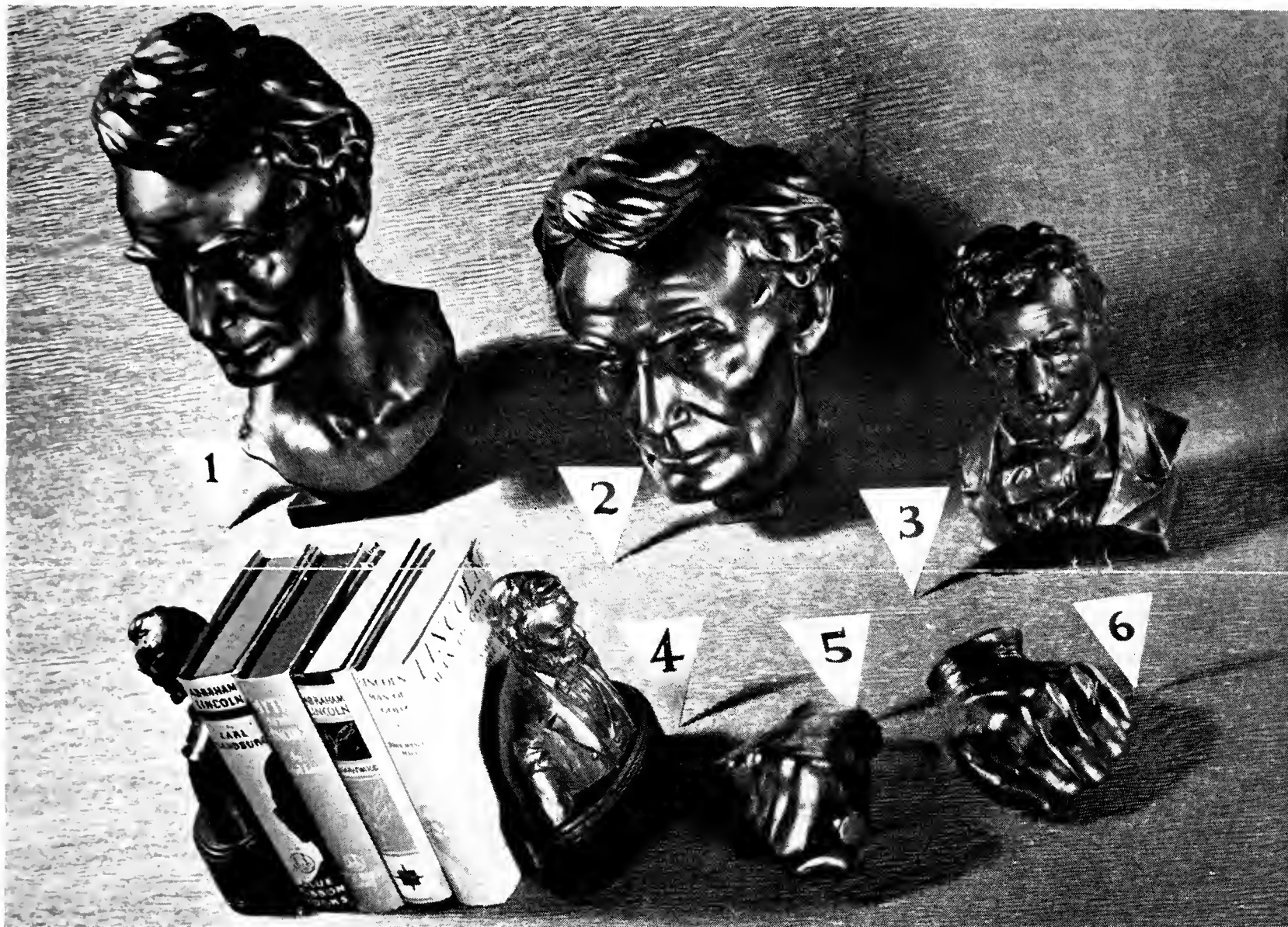
(1) Bust by Volk; (2) Head by Volk; (3) Bust by Voting; (4) Book Ends and Lincoln Books; (5) Right Hand; (6) Left Hand. These items are described in detail below.

Here are listed and described Lincoln material suitable for prizes, mementoes, and displays which can be secured direct from the Supply Section of the Agency department. The prices are the cost prices based upon wholesale purchases.